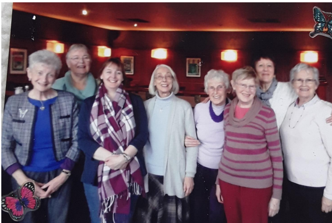
Scotland members 2017. By kind permission from left to right