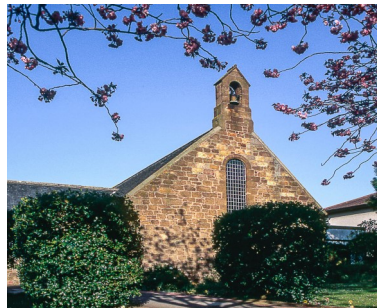
Longniddry Parish Church (Church of Scotland)

On Mother's Day, remember all mothers and give thanks for all they do.