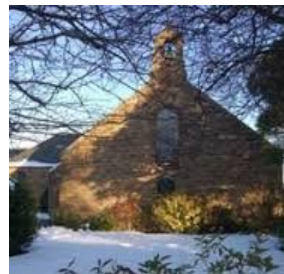
Longniddry Parish Church (Church of Scotland)

As we look forward at this time of short days and long nights may we experience the Light of the World as a lamp to our feet.